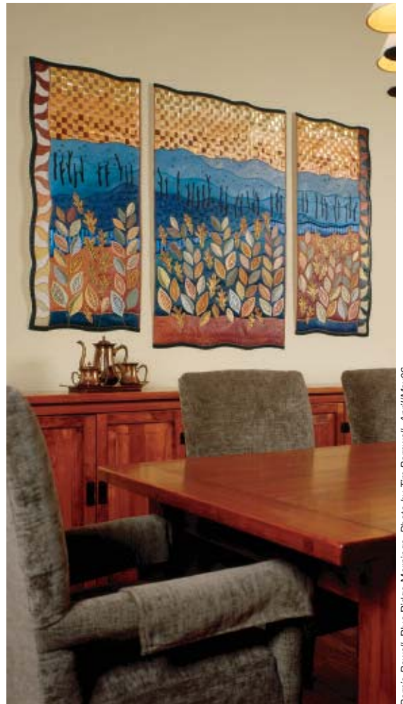
Bernie Rowell, Blue Ridge Mornings. Photo by Trm Barmwell, April/May06